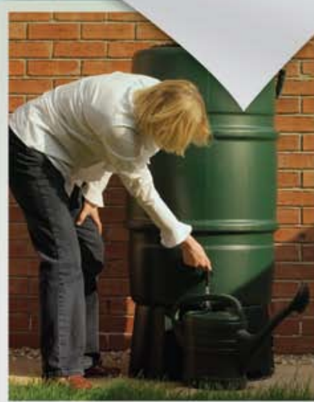
Rainwater harvesting can provide a free water source once your initial investment is recouped.

Both graywater recycling and rainwater harvesting are great ways to help preserve our natural resources, and they can both provide you with cost savings on your water bill!