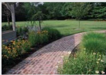
Walkways are wider and more formal than paths.

Walkways are wider and more formal than paths. They're commonly used to get from the driveway to the house or from the house to the garage. They should be wide enough to accommodate two people walking side by side, and it never hurts to incorporate a few curves for added visual appeal. Available construction materials vary widely, including poured concrete, pavers, gravel, slate and even tiles.