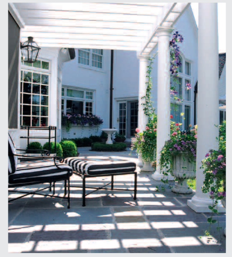
The design of your patio should be dictated by how you want to use it.

Above all else, be sure to take your time and think ahead. By planning carefully, you'll be much happier with the end result!