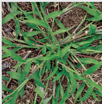
One crabgrass plant can produce thousands of seeds per season.

The seeds germinate in the late spring and early summer. Once crabgrass plants start growing, they expand outward in circles that can reach 12" in diameter. The plants eventually die off in the fall, leaving behind dead areas in the lawn where new crabgrass seeds are likely to germinate again during the next growing season.