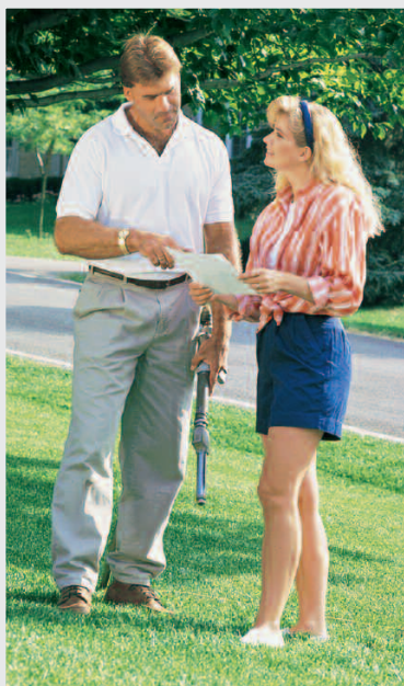
Working together, we can help your property reach its true potential.

We'll be providing you with this newsletter and other important information all season long to help you get the most from your investment. As always, please feel free to call us anytime with your questions and concerns. Everyone at Sunrise looks forward to working with you, and we appreciate your business!