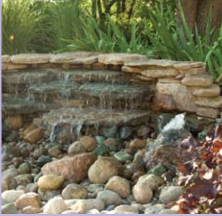
Live up your landscape with a disappearing water feature!

Put a stop to insect damage before it starts this year. Consider a dormant oil application in the early spring!