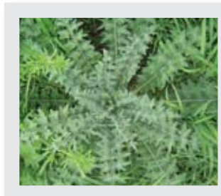
Broadleaf weeds can pop up at any time during the growing season.

Will our lawns ever be completely free of broadleaf weeds? It's unlikely. However, by combining proper maintenance practices with post-emergent spot treatments, we can significantly reduce the impact of these pests on our turf.