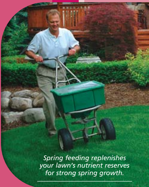
Spring feeding replenishes your lawn's nutrient reserves for strong spring growth.