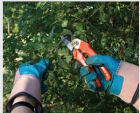
Trimming and shaping prior to new growth is beneficial.