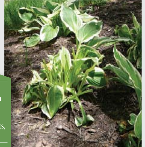
Deer-feeding damage on hostas.