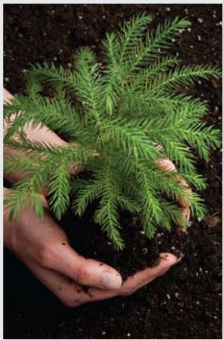
Tree planting is a great way to improve environmental quality while enhancing the looks of your landscape.

Planting a new tree will not only enhance the looks of your landscape, but it can help you save money on your energy bills while improving the environment we all share. Consider these statistics on the value of planting trees: