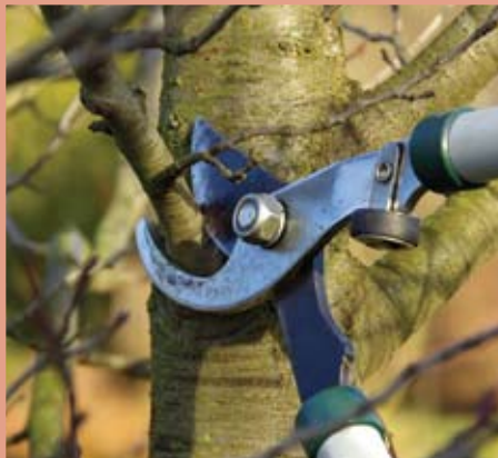
Regular pruning helps to prevent health and structural problems.

much, so pruning will cause less of a disruption than it would during the summer months.