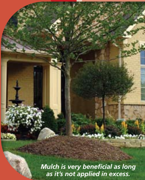
Mulch is very beneficial as long as it's not applied in excess.